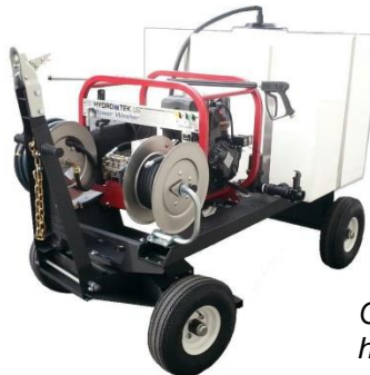
Optional tank skid transporter

Downstream injection kit (#AC340), Hour meter (AM512), Wheel kit (#AHS13), Tank skid/reels (200gal. #T185TWH, (270gal. #T270TWH), Tank Skid Transporter (#TSKDT), Transport trailer (200gal. #T185CPH)